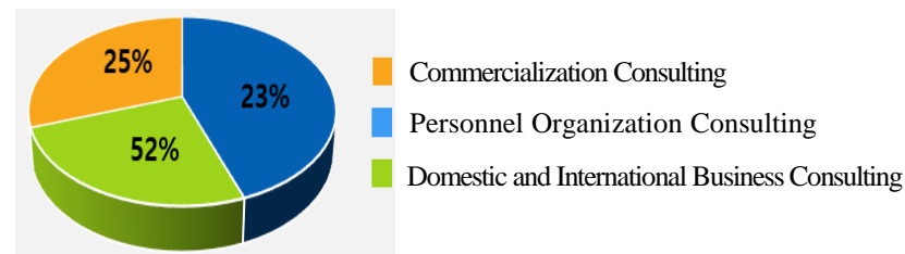
Total Consulting Revenue by sector